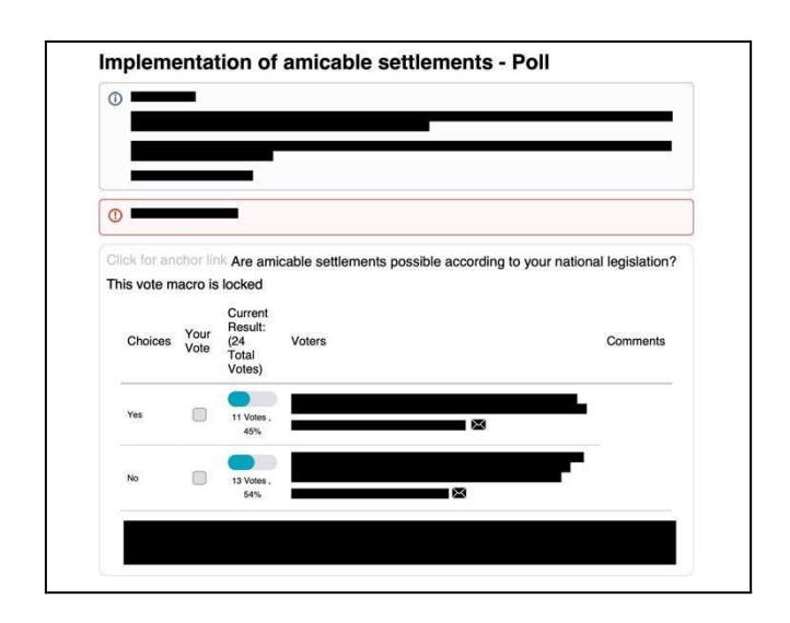
Figure 2 – EDPB Implementation of amicable settlements – Poll (without date)

Another EDPB document appears to compile DPA answers to questions about the rules applying to 'amicable settlements', but it was only shared by its services after being heavily redacted (see Figure 3).<sup>184</sup> Only the answers of three DPAs are at least partially accessible, from Liechtenstein, Hungary, and Finland.